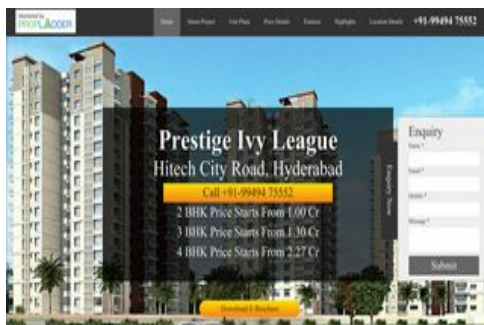
Prestige Ivy League